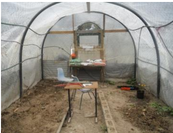
Year 11/12 Students Lilydale District School

Students have established a vegetable garden and used old tyres to make a strawberry patch and herb gardens. We are looking forward to the warmer months to see some real growth in the plants.